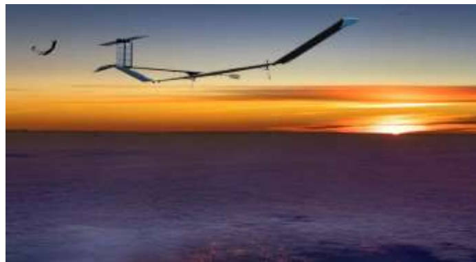
Fig. 3. Aalto's Fixed wing HAPS (Zephyr) [4]

The HAPS payload layer is the aspect of the HAPS system that directly relates to what 3GPP release 17 and beyond specifies. NTN-based systems will be implemented mainly through two broad architectural paradigms: regenerative (advanced payload on-board) and non-regenerative (basic repeater payload) [5]. The 3GPP technical specification does not provide any solution to how the HAPS platform layer should meet the requirements to keep the HAPS airborne and available for service. 6G will be access network agnostic like 5G [6] so that it can provide 6G services through 3GPP and non-3GPP radio access technologies (RAT). The HAPS Alliance is an international organisation championing the interest of HAPS and working hard to address the specification for the platform layer and some aspects of the hardware for the payload layer. The HAPS Alliance may likely succeed in unifying these layers at the specification level.