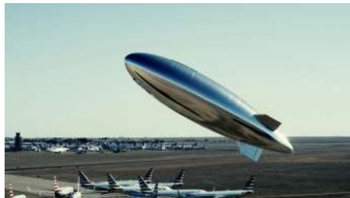
Fig. 5. Sceye's Airship HAPS

The research methodology and data sourcing strategies employed in this position paper provide a comprehensive foundation for understanding the role of HAPS in implementing 6G networks. The paper aims to present balanced, established, and some aspirational perspectives on the opportunities and challenges associated with deploying non-terrestrial networks via high-altitude platform stations for 6G implementation.