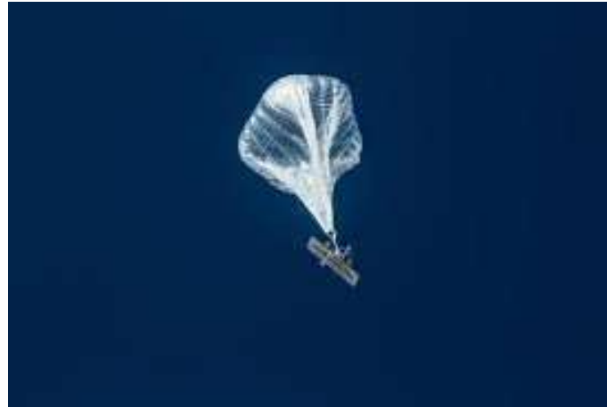
Fig. 4. Project Loon Balloon HAPS