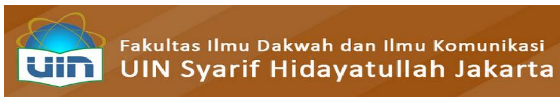
Figure 2 faculty of da'wah and communication science in UIN Jakarta

The Existing Infrastructure Evaluation explains about the Characteristics of UIN Jakarta Information and Communication Science Information System users, where the user of this system consists of Students and Lecturers. Where is this User who uses this application in finding information, re-registration, or the latest information related to Da'wah Science and Communication UIN Jakarta. The sampling technique of respondents used snowball sampling technique. The author uses 20 respondents, consisting of 10 students and 10 lecturers. The Tangerang Selatan web page is http://fidkom.uinjkt.ac.id contained in Figure 2 is the initial web page.