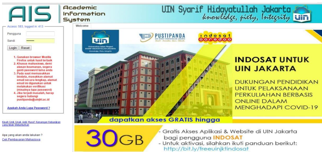
Figure 5 E- Campus in Da'wah and Communication Science