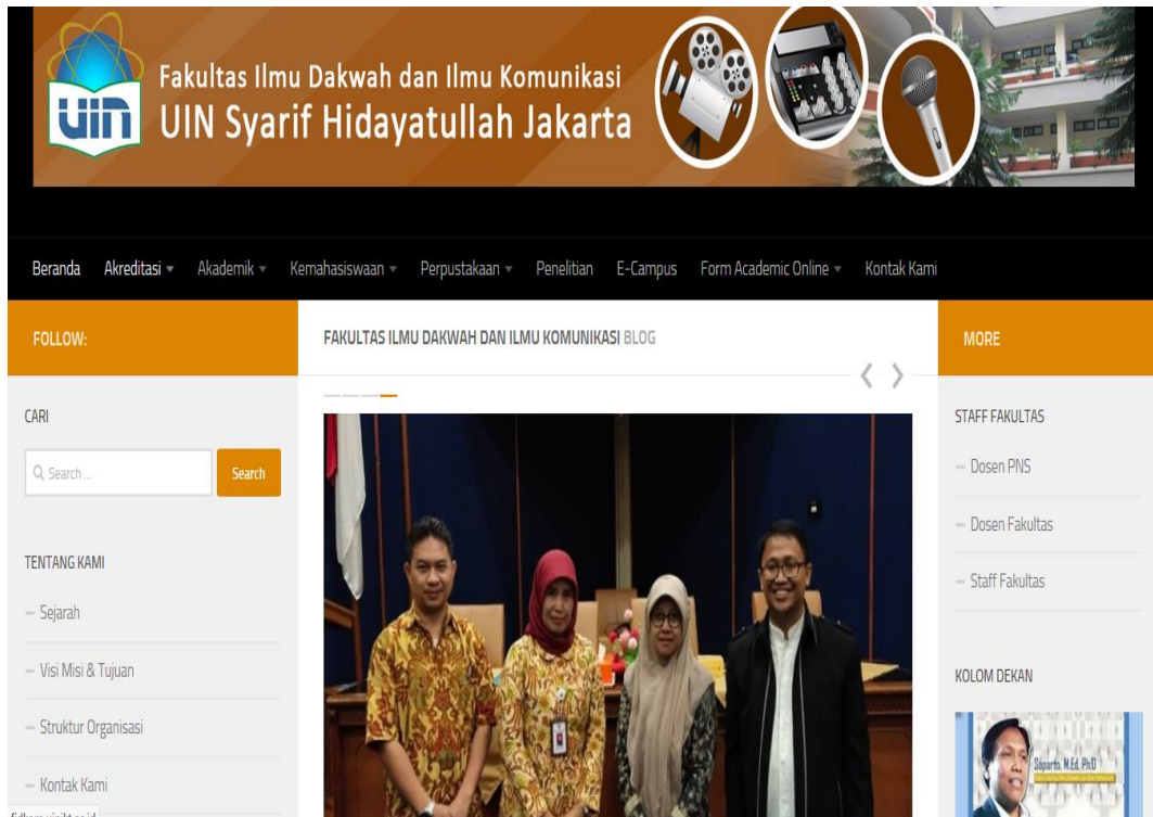
Figure 4 Main Page of Implement KM System in Da'wah and Communication Science