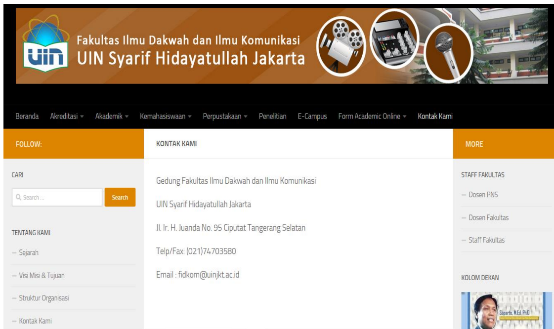
Figure 6 General and procurement section page

Figure 6 is our contact, which consists of the address and telephone number that can be contacted.