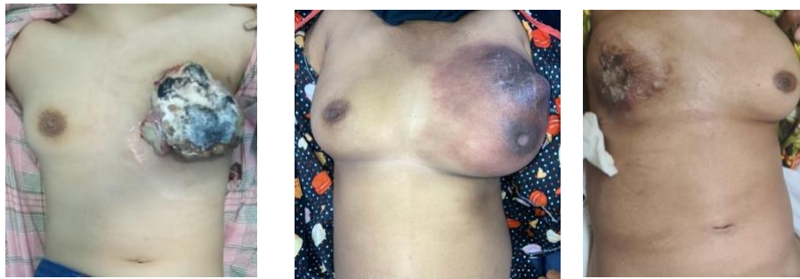
Figure 1. Data collection of Patients with Breast Ca at RSUP HAM Medan

characteristics, tumor characteristics, biomarker status, recurrence of metastatic brain tumors based on Magnetic Resonance Imaging (MRI) examination, and data on therapeutic regimens in cases of brain metastases of breast cancer. ER and PR status were determined by immunohistochemical examination. the intensity of the HER2 3+ immunohistochemical staining was considered positive.