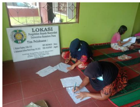
Figure 2. Making a written batik pattern

Pattern making on written batik is done by drawing the cloth first according to the desired motif. What is needed for drawing is an ordinary pencil. In basic training, written batik is made on a handkerchief size. Motifs made according to the wishes of group members are pictures of leaves, flowers, sea horses, dolls, and pictures of abstarck. It takes a long time to make written batik on 2 meter shirt pattern because of the wide size of the cloth.