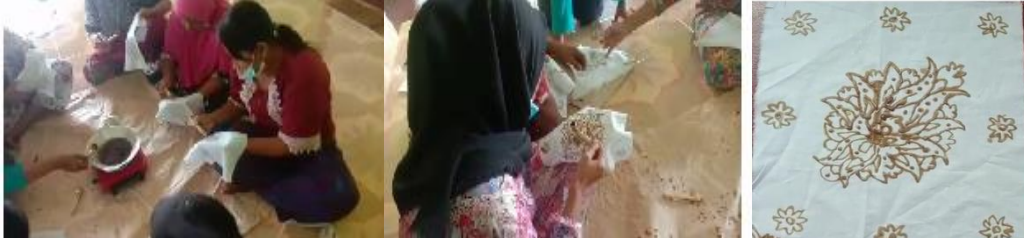
Figure 3. Canting proses

Preparation before chanting is to preheat the wax at a temperature of 60 to 70 degrees Celsius on the canting stove. After the wax has melted, it is craved for a while, and in warm conditions, it is pressed. Cutting is done carefully so that it looks neat in accordance with the previously made pattern. Pengantangan aims to draw a pattern on the cloth. The embroidery process on written batik takes a long time. The wider the fabric to be painted, the longer the working process will be.