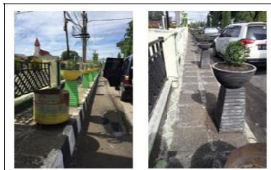
Figure 4. Random Location of Furniture

The random location of street furniture causes pedestrian lanes to be narrow. There are some flower pots and trash boxes put on the pedestrian lane, in front of the Town Hall (Figure 4).