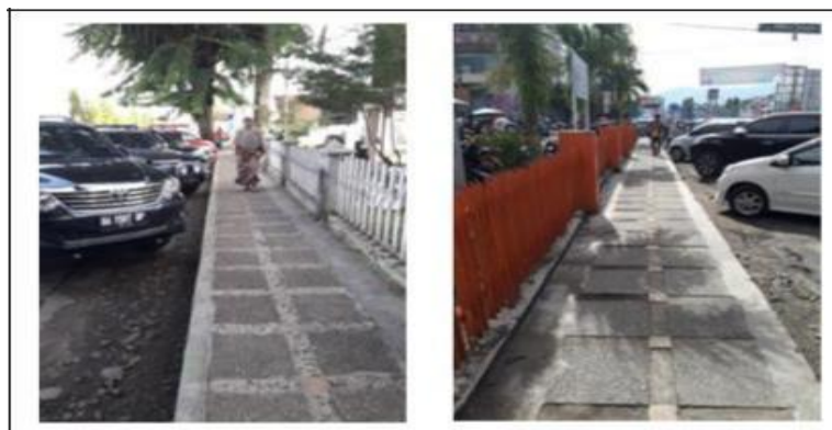
Figure 3. Pedestrian Lane in Downtown of Padangsidempuan

The condition of the surface of the pedestrian lane has met the requirements: hard, flat, and not slippery. The hardening of the pedestrian lane uses natural ceramic material (Figure 3).