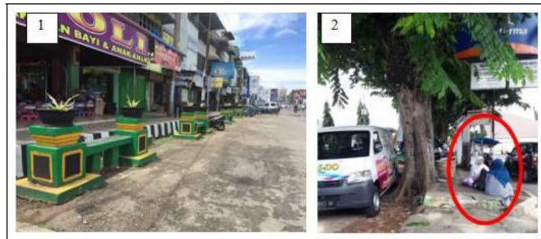
Figure 5. (1) Area for Relaxing, (2) Pedestrian sits down on Pedestrian Lane.

The area for relaxing is not planted by shade trees so that people are exposed directly to the sunlight. Therefore, pedestrians would rather choose to sit down under the shady trees on the pedestrian lane (Figure 5).