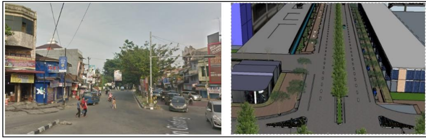
Figure 2 Existing Condition (left) Pre-existing Design (right)

pedestrian so that it can meet the needs of its users. Also, additional elements, such as chairs, will be added (Figure 2).