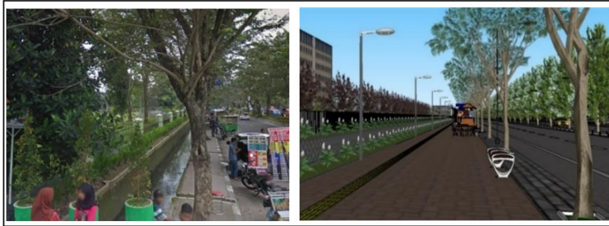
Figure 5 Pedestrian condition (left) and Pedestrian Pre-Design (right)

Road conditions in this segment are quite good, but street furniture in this segment has not been accommodated. So that roads and corridors that have been provided with street furniture will be designed along with pedestrian ways to increase pedestrian comfort. On the highway corridor, lights will be placed on the road that leads to the side of the way to illuminate the passage and the main road. The distance between lamps is 15 m (Figure 5).