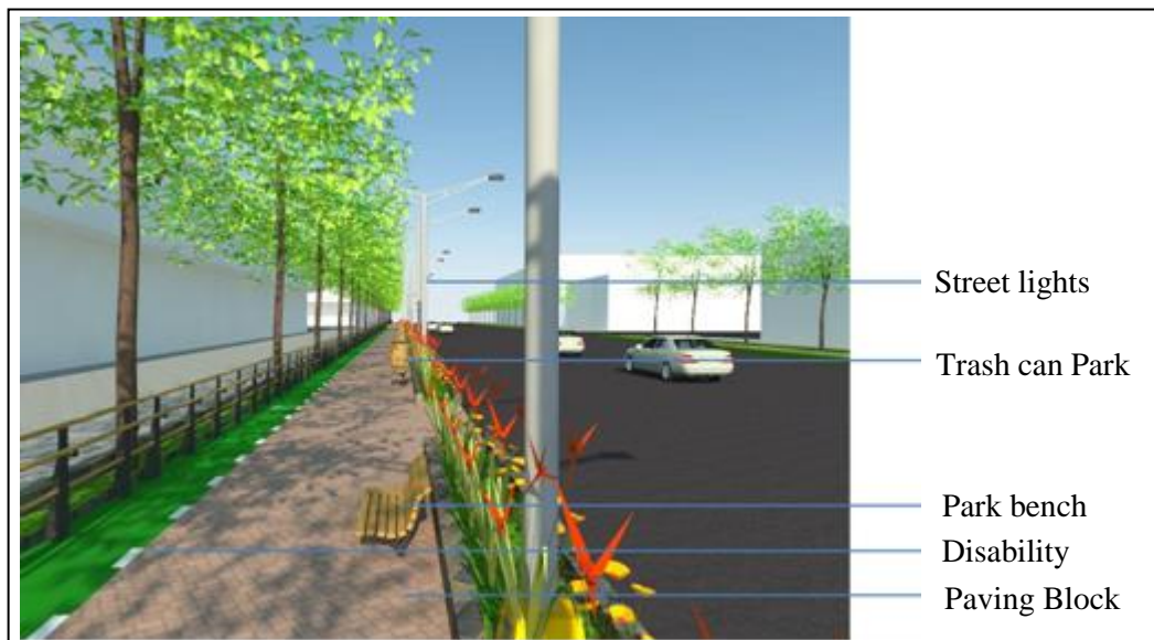
Figure 8 Pre-designed

The condition of the shops in this segment is very chaotic. This because the number of advertisements that are placed carelessly on the building so that it causes shopping buildings in this segment does not look good, so it seems slum. The condition of the corridor in this segment is also inadequate. So that a shop will be designed with an adequate passage to meet the needs of its users; moreover, it was equipped with vegetation that functions as a shade and barrier to air pollution. The plant will be placed on pedestrian ways in the form of shrubs. In this area, street furniture will also be set to increase the comfort of pedestrians. On the main road, street lights will be placed that lead to the side of the way. Garbage bins are placed at intervals of 20 meters apart (Figure 8).