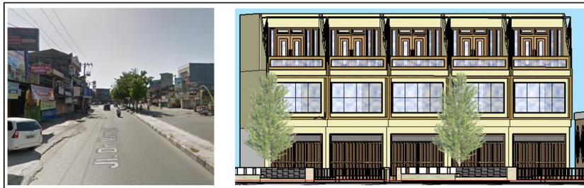
Figure 3 Shopping Conditions (left) and Shop Pre-Design (right)

The main principles applied to commercial passages related to this pedestrian route are: creating a sustainable pedestrian path along commercial corridors, develop corridors oriented to pedestrian comfort through structuring the road landscape and harmonious circulation system, develop pedestrian pathways that are easily accessible by cross-gender and different ability people, equipping pedestrian lines with adequate signage and elements, and the dimensions of the pedestrian path are 3-4 m (Figure 3).