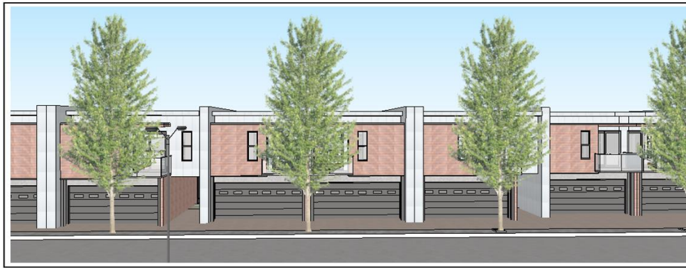
Figure 7 Shop Pre-Design

The condition of the shops in this segment is very chaotic. This because the number of advertisements that are placed carelessly on the building so that it causes shopping buildings in this segment does not look good, so it seems slum. The condition of the corridor in this segment is also inadequate. So that a shop will be designed with an adequate passage to meet the needs of its users; moreover, it was equipped with vegetation that functions as a shade and barrier to air pollution. The plant will be placed on pedestrian ways in the form of shrubs. In this area, street furniture will also be set to increase the comfort of pedestrians. On the main road, street lights will be placed that lead to the side of the way. Garbage bins are placed at intervals of 20 meters apart (Figure 8).