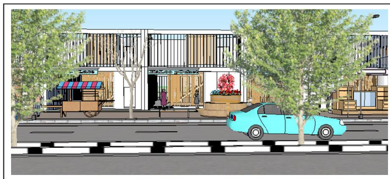
Figure 6 Shop Pre-designed

The main point in this pre-design concept is the provision of locations for street vendors who are not arranged in the corridor of the road along this segment. Where the street vendors choose a place to open a business along the pedestrian lane so the road corridors are not used as they should. The concept in this pre-design emerged from the comparative study and literature review of the State-Madison WI USA road corridor, where the existence of pedestrian lanes and shops/restaurants was not eliminated but was given a boundary between pedestrian paths and shop/restaurant (Figure 6).