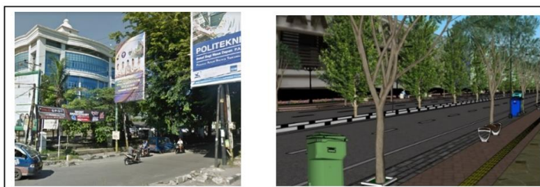
Figure 4 Road condition (left) and Pre-designed road (right)

The condition of the shops in this segment is very chaotic. This because the number of advertisements that are placed carelessly on the building so that it causes shopping buildings in this segment does not look good, so it seems slum. The condition of passage in this segment is also inadequate. So that a shop will be designed with an adequate corridor to meet the needs of its users, it is equipped with vegetation that functions as a shade and barrier to air pollution (Figure 4).