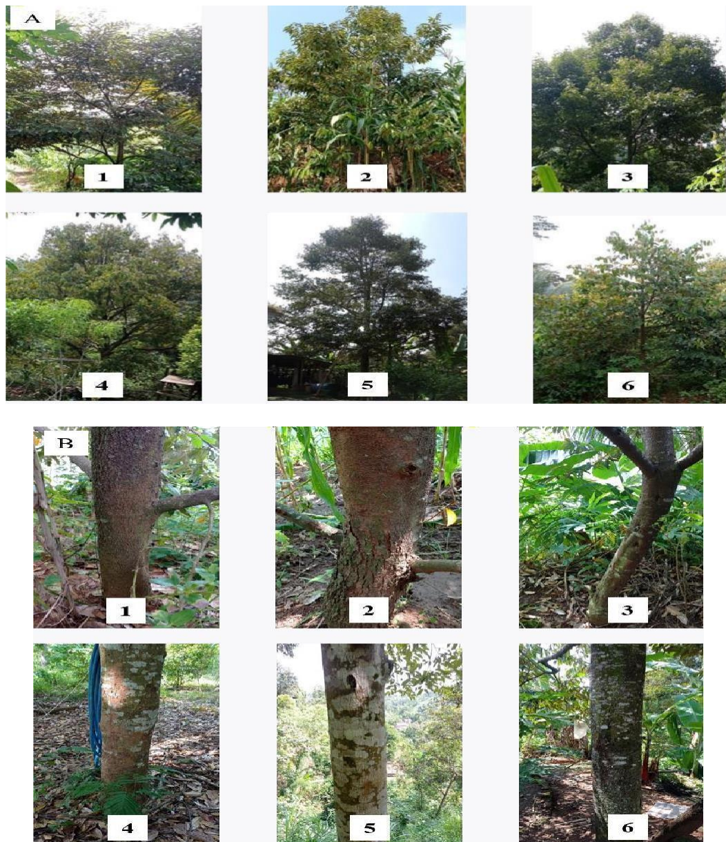
Figure 1. Vegetative characters of Durian in Semen Sub-district, Kediri Regency. A. Crown shape (1. duri hitam-irregular; 2. musangking- irregular; 3. segitiga madu-pyramidal; 4. mentega-oblong; 5. bajul coklat-pyramidal; 6. bawor-pyramidal), B. Trunk surface (1. bawor-smooth; 2. musangking-rough; 3. duri hitam-smooth; 4. segitiga madu-very rough; 5. kerucut-smooth; 6. bajul coklat-rough).

Based on observations of the morphological characters of the trees, 5 types of crown shapes were found from 10 types of durian plants identified i.e. pyramidal, oblong, spherical, semi- circular, elliptical and irregular shapes (Figure 1). Whereas durian leaves in Semen sub-district include elliptical shape, with the color of the upper surface of the leaf being dark green, the color of the lower surface of the leaf being silvery brown and copper brown, the condition of the petiole is round, the shape of the leaf blade is long round, the shape of the base of the leaf is rounded and blunt. However, according to Setiawan (2015) states that durian leaves are generally oblongus with a tapered tip, which is alternately located and grows singly after that the leaf structure is rather thick with the upper leaf surface being shiny green and the lower part brown or golden yellow.