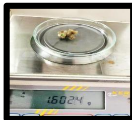
Figure 6. Weighing the weight of the callus

According to Indah and Ermavitalini (2013), the weight of the callus has a content of water and carbohydrates. The provision of nutrients will ensure the availability of energy sources for cells to be able to grow. The weighing of the heat of the callus of the explant Sansevieria ehrenbergii can be seen in Figure 6.