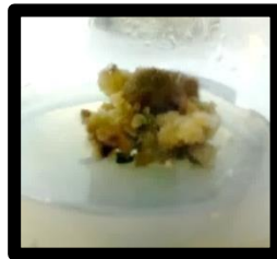
Figure 4. Crumbly Callus Texture

The treatment of NAA 2 mg.l -1 + BAP 1 mg.l -1 has a compact textured callus texture. It is suspected that obtaining a compact callus requires higher auxin than cytokinins. According to Nisak et al. (2012), the compact callus structure has a dense, dense, and difficult- to-separate arrangement of cells. The compact texture of the callus is the effect of auxin and cytokinin application that affects the water potential in the cell. According to Dhaliwal et al. (2003), auksin can loosen the fibers of the cell wall so that cells are more flexible and nutrients will enter diffusional. This will continue until the water and osmotic potential is balanced and the cell becomes turgid, then turgid cells with the addition of cytokinins will affect the division and lengthening of cells hance cell divides faster and the callus becomes compact. Andaryani (2010), stated that kalus that has a compact texture can accumulate more secondary metabolites while the crumbly callus can be used for suspension culture in aim is to increase the number of callus. Whereas the Figure 5 depicts the compact callus texture.