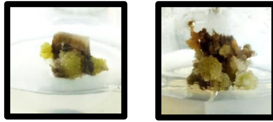
Figure 3. Callus is green and callus is yellowish-green

The research showed that yellowish-green callus formed on the treatment of NAA 1 mg.l -1 and a combination of NAA 2 mg.l -1 + BAP 2 mg.l -1 . A yellowish-green callus is formed is a process of maturation of tissues characterized by a change in the callus color. According to Trimulyono et al. (2004), the callus is yellow in color because it indicates the more mature the callus age. According to Fauzy et al. (2016), the diminishing capacity for callus regeneration can be identified by the progressively lax alterations in its morphology, the color of the callus that changes from greenish-yellow to brownish- yellow and to brown.