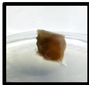
Figure 9. Explants browning

Reducing contamination by fungi and bacteria can be done by selecting healthy plant material (free from pests and diseases), keeping the culture room sterile, closing the culture bottle after planting tightly, and careful work procedures, so that contamination by bacteria can be prevented by adding antimicrobials such as antibiotics. The browning explant can be seen in Figure 9.