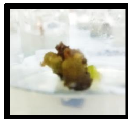
Figure 5. Compact Callus Texture

The treatment of NAA 2 mg.l -1 + BAP 1 mg.l -1 has a compact textured callus texture. It is suspected that obtaining a compact callus requires higher auxin than cytokinins. According to Nisak et al. (2012), the compact callus structure has a dense, dense, and difficult- to-separate arrangement of cells. The compact texture of the callus is the effect of auxin and cytokinin application that affects the water potential in the cell. According to Dhaliwal et al. (2003), auksin can loosen the fibers of the cell wall so that cells are more flexible and nutrients will enter diffusional. This will continue until the water and osmotic potential is balanced and the cell becomes turgid, then turgid cells with the addition of cytokinins will affect the division and lengthening of cells hance cell divides faster and the callus becomes compact. Andaryani (2010), stated that kalus that has a compact texture can accumulate more secondary metabolites while the crumbly callus can be used for suspension culture in aim is to increase the number of callus. Whereas the Figure 5 depicts the compact callus texture.