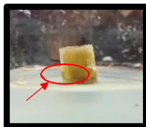
Figure 2. When Callus Appears

Auxin application combined with cytokinins will cause a callus to form faster than auxins given singly. The initiation of callus development commences with the enlargement of the explant which is a response to the application of the given ZPT. Figure 2 displays when the callus appears.