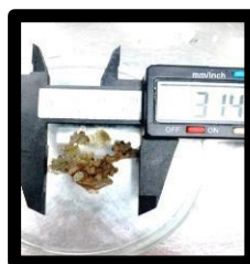
Figure 7. Callus diameter measurement

Application a higher BAP than NAA triggers cell division, thereby increasing the callus diameter. The application of NAA singularly has not been able to increase the diameter of the callus because in increasing cell division requires more cytokinins than auxins. According to Waryastuti et al. (2017), the application of BAP in the right concentration can be stimulating in the growth of callus and buds because it has a significant function in natural organogenesis, and Figure 7 shows the callus diameter measurement.