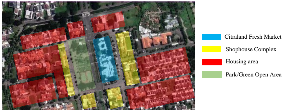
Figure1. Function analysis of surrounding buildings

This market is a traditional market packaged in a modern building. This market was founded in 2015 on an area of 5000 m 2 in the Taman Puspa Raya Complex, Citraland Surabaya. This complex is a shophouse area that has a public park and is part of the elite residential area in West Surabaya, namely Citraland. Citraland has been one of the leading real estate companies in Surabaya since 1993 (Ikmal et al, 2023). This area offers a variety of facilities including a golf course and clubhouse, international schools, shopping centers and more. Citraland Fresh Market is one of the traditional shopping centers in this area.