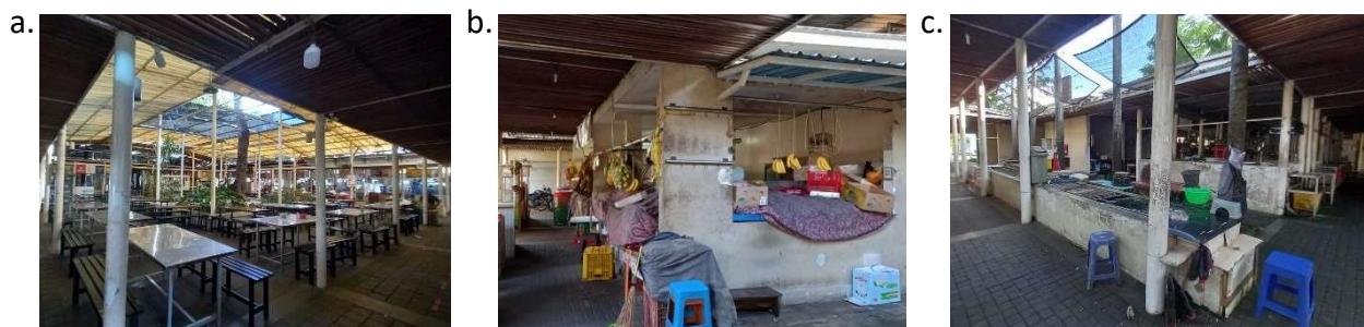
Figure2. (a) Food court; (b) Dry Market; (c) Wet Market

This building has two areas, namely the market area and the food court. In the market area there is a wet market consisting of meat and fish and a dry market consisting of fruit and vegetables. There are stalls around the market stalls selling household equipment and even snacks. The market and food court are separated by a small entertainment stage in the middle of the building area. The food court area sells various types of food and drinks. This market is also equipped with supporting facilities, such as toilets, prayer room, health room, smoking area, entertainment stage and large parking area. This market is open every day from 06:00 AM to 2:00 PM.